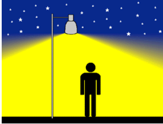
Illustration: Full cut-off lighting.

Full cut-off lighting directs light down and to the sides as needed.