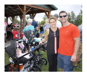
Families enjoying the festival